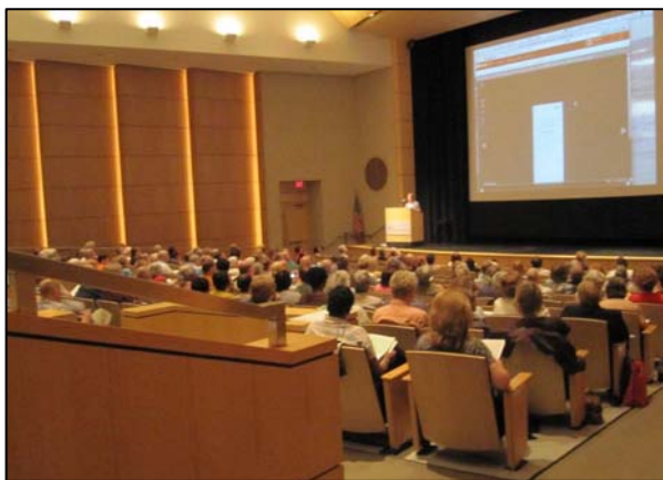
This image of the Main Library Auditorium during a presentation

This year’s day-long genealogy program at Main Library took place on Saturday, August 6 and drew our largest crowd ever, with 271 in attendance.