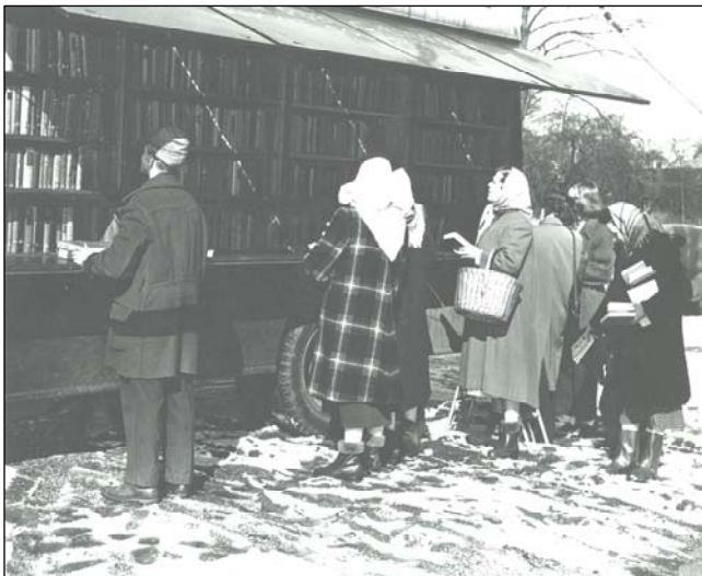
This image is from the Library History Collection in the Special Collections Division.