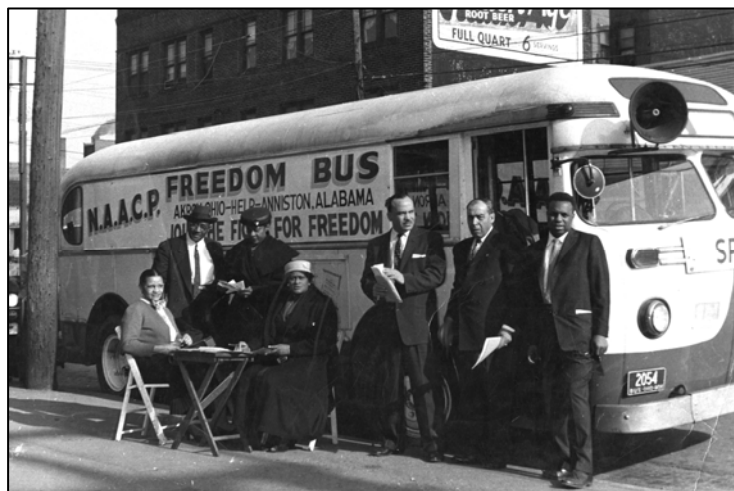
This image shows members of the Akron, Ohio Chapter of the National Association for the Advancement of Colored People (NAACP) in front of a bus used to transport Akronites on a freedom ride to Anniston, Alabama.

Born in 1906 in Montgomery, Alabama, he began peddling newspapers on foot and from his father's fish cart. In 1927, while a student at Central High School, he published Akron's first African American directory, The Akron Negro Yearbook . As a young photographer, he used the family bathroom as his darkroom. After high school, he sold soap and