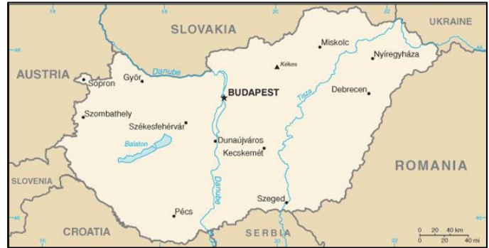
Present day Hungary borders countries that were previously part of the Austrian-Hungary Empire.

WWI. The number reveals just how many young men had immigrated to the Akron area immediately preceding the war. After the end of WWI, treaties redrew European borders, and it is important to realize that many who called themselves “Hungarian” prior to the war were from what today are now the Czech Republic, Slovakia, Romanian or the former Yugoslavia.